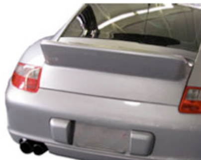
997 Ducktail - A modern version of the original RS Carrera Ducktail. Direct bolt on. Simple clean, retro