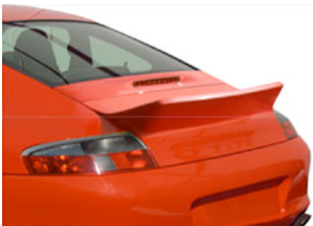
996 Ducktail - A modern version of the original 911 ducktail. One piece.