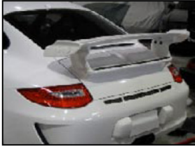
997 2010 3.8 GT3 Tailbase