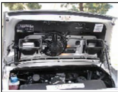
997 Carrera Spec II Liner

Also unlike on 996, a simple replacement wiring harness will not prevent the wing function warning light from activating, when switching to a fixed wing. Some of our Getty Design proprietary insert wings do not have this problem. Otherwise the computer is easily reset to correct this.